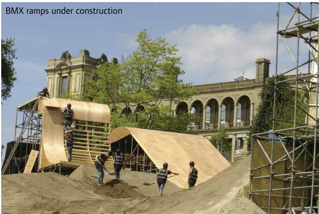
BMX ramps under construction

Warner Estate Residents Association June 2012